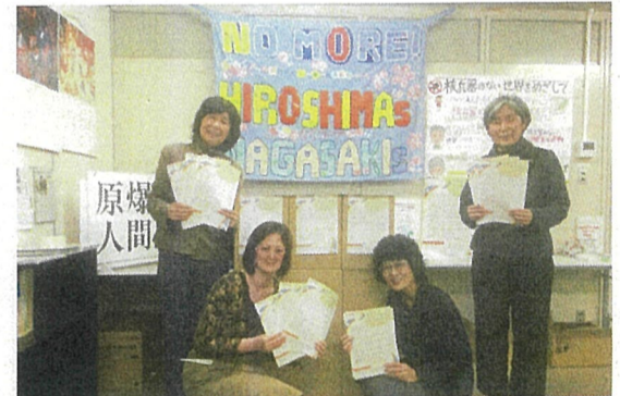
We're doing our best too!

Nara Co-op Heiwa Library was established in October 2019. “Heiwa” means “peace” in Japanese. This place has existed as a base of activity, to record the dropping of atomic bombs on Hiroshima and Nagasaki, and memories of the war in Nara Prefecture. We will devote ourselves to pass on these painful experiences to future generations. And we will be sure that it makes for the accomplishment of peace.