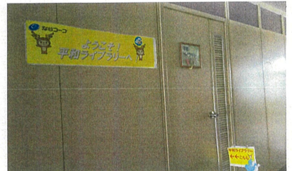
Welcome to Heiwa Library