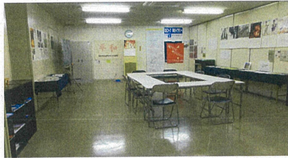
A place of sharing fellowship and learning