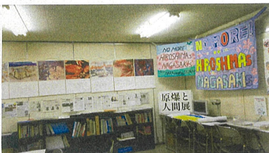
Exhibition and Digital Archive