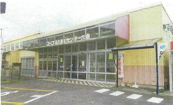
It is located in CO-OP Fureai Center Rokujo